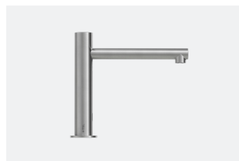
Straight Spout Tap Large TSL.940