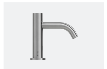
Sensor Deck Mounted Tap Small TSL.990