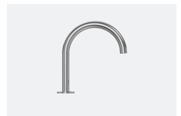
Radius Auspex Tap Swan Neck TSL.892