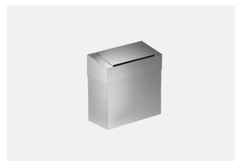
Wall-Mounted 7L Sanitary Bin TSL.909