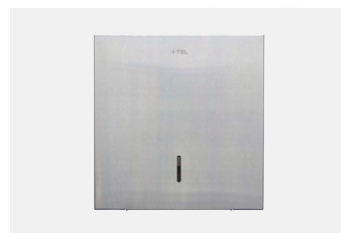
Lockable Toilet Roll Holder TSL.842