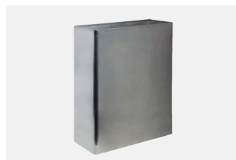
25L Waste Receptacle TSL.279