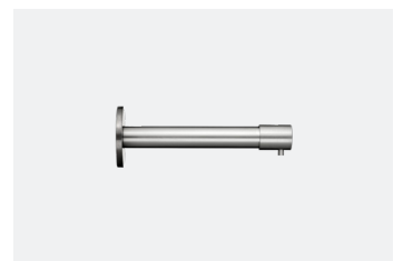
Wall Mounted Manual Soap Dispenser TSL.470