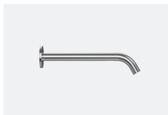
Radius Auspex Tap 220mm TSL.894