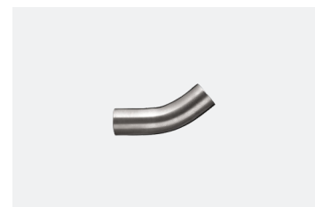
Coat Hook TSL.974