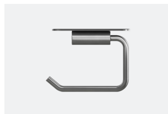
Single Toilet Roll Holder With Shelf TSL.48