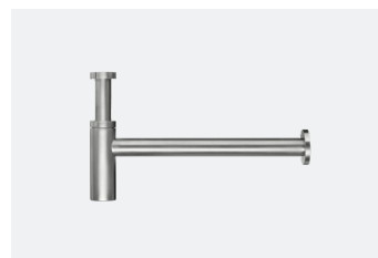
Adjustable Bottle Trap TSL.650