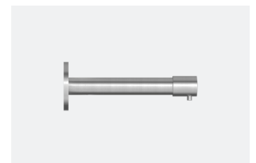
Wall Mounted Manual Soap Dispenser TSL.470